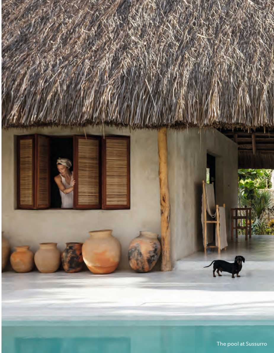
The pool at Sussurro

This sustainably minded 'modern hostel' in Gerlos is 100% powered by renewable energy. Slick, minimalist rooms come in earthy colours and natural fibres, and rates include organic breakfasts and afternoon tea on return from the slopes. From €75 (£65), B&B. dasgerlos.com