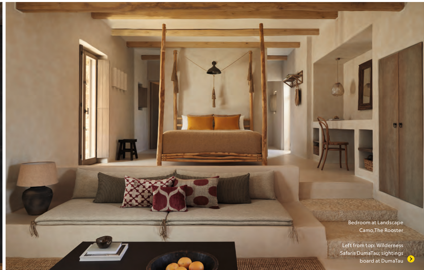
Bedroom at Landscape Camo, The Rooster

The Majorcan capital is no stranger to sumptuous townhouse hotels, but this new, adults-only addition — arranged like a riad, encircling a pretty, palm-shaded patio with a pint-sized plunge pool and glowing lanterns — almost seems purpose-built for romantic getaways and honeymoons. Each of the 11 individually designed, seductive suites offers its own treasures in well-worn velvet, jewel-toned fringe and swirling carpets, but be sure to tear yourself away for a large coupe of cava in the Morokko Bar. From €340 (£290). palmariad.com