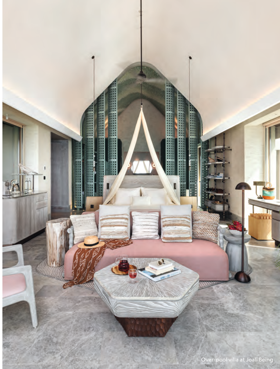
Over-pool villa at Joali Being

This former archbishop's home in Cashel, set among the green hills of County Tipperary, has had a multi-million-euro revamp. Step past the log fires and period features of the reception rooms and you'll emerge into a walled garden, where views stretch over fields to the Rock of Cashel, the medieval castle that once served as the seat of the Kings of Munster. Glimpses of this grand heritage lie behind the hotel's transformation — regally decorated spaces with plush upholstery and lavish artwork. There's a slick pool and spa, too, a new bedroom wing and The Bishop's Buttery restaurant reboot, which already has gourmets whispering of Michelin stars. From €289 (£245), B&B. cashelpalacehotel.ie