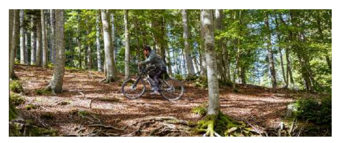
GUIDED BIKE RIDE TOUR

The following activities are not included in your stay and require at least one-week reservation prior actual date in order to be made available. Refer to the Concierge Team for any question or assistance in booking one of the followings.